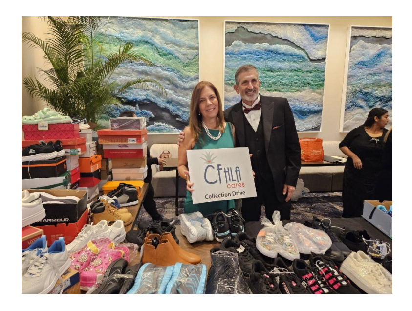
Click to See More Cares Collection Drive Photos