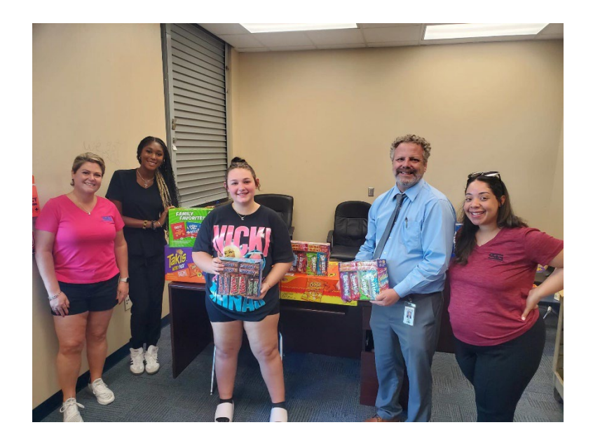
Thank you, Structural Solutions Group for supporting this creative and impactful way of encouraging student success!

Structural Solutions Group recently partnered with Apopka High School and donated items to the school's Darter Store . Through this initiative, students earn "Darter Dollars" when they demonstrate positive behaviors, which they can use to purchase snacks and other small rewards.