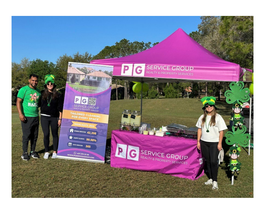
Best Beverage Restore Now