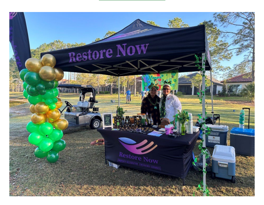
First Place Team Wayne Automatic Fire Sprinklers