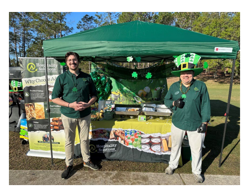
Best Food PG Service Group