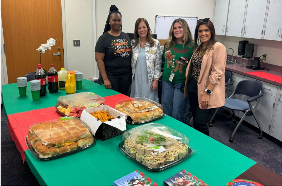
Partners in Action - SimpleFire Brings Gift Cards to Roberto Clemente Middle School