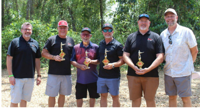
2nd Place Team