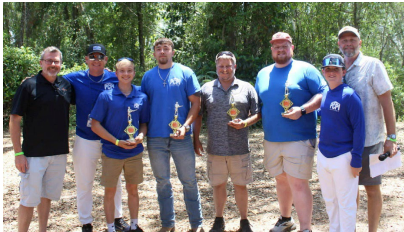
3rd Place Team