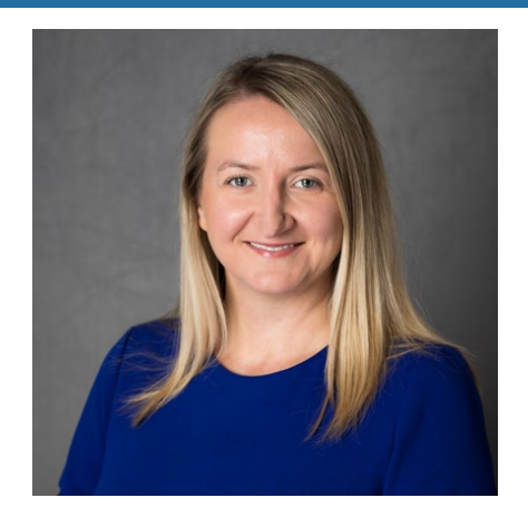
Anna Snow Castle Hotel, Autograph Collection